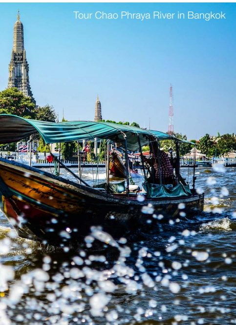
Tour Chao Phraya River in Bangkok