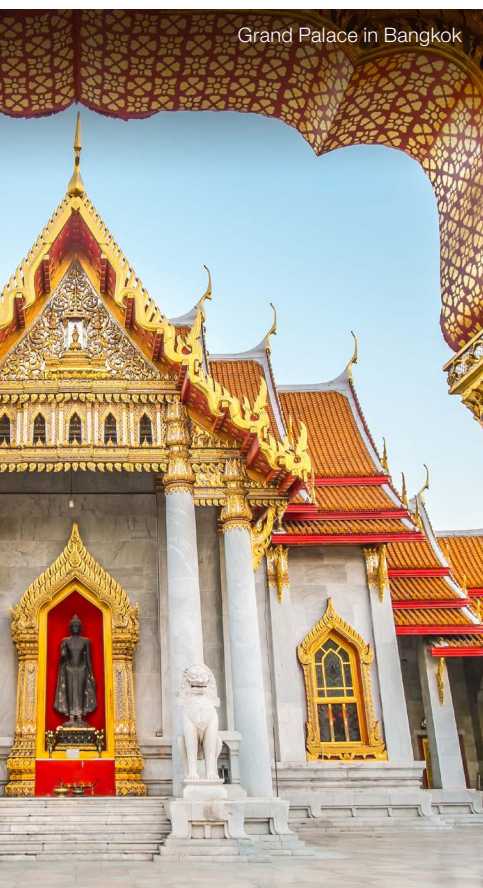
Grand Palace in Bangkok