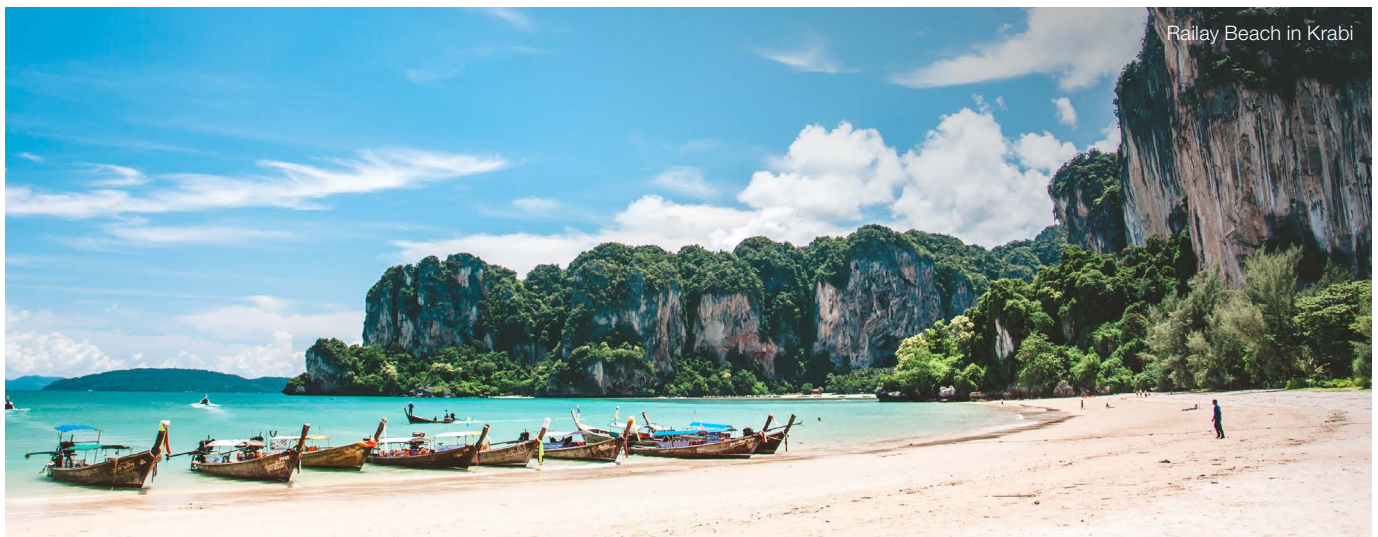
Railay Beach in Krabi