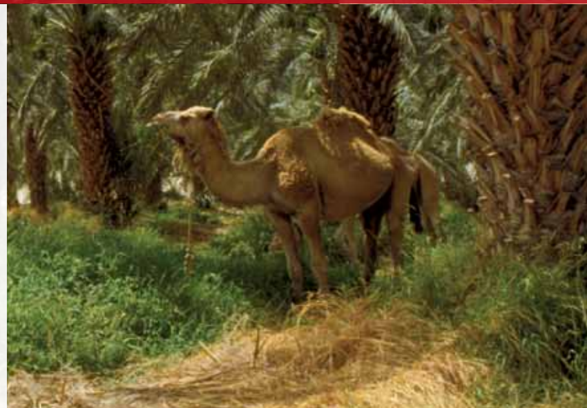
Camels at a desert oasis Israel

While in Israel, spend a night at a Bedouin camp. The camp offers a unique experience of the traditional life of the nomadic Bedouins. Music, poetry and dance play a role in their culture. The traditional musical instruments include the shabbaba, a long metal pipe similar to a flute, and rababa, a one-string violin. Women primarily provide the vocals, and sit in rows facing each other. When you arrive, you'll get to enjoy a camel ride through the desert and explore the astonishing area of the Dead Sea. This intriguing spot contains almost six times the salt as the ocean. Return to the camp for an evening of music and hospitality.