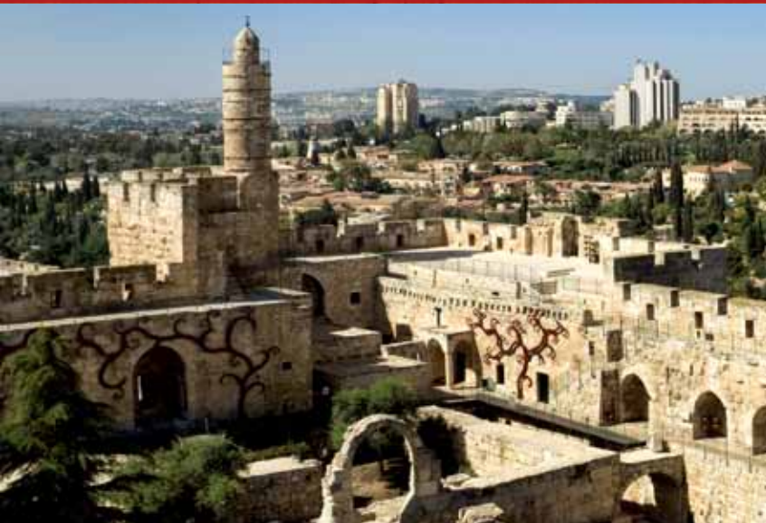
Jerusalem City Jerusalem, Israel